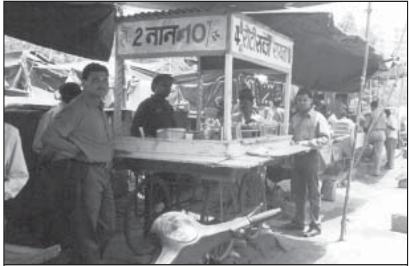
Hawkers at CGO complex : chaotic survival despite repeated removals.

We got a good glimpse into the working of our system when, during our first meeting, Ram Babu openly declared : “ Behenji , we are very clear on this. When we don’t want to do something we know how to obstruct