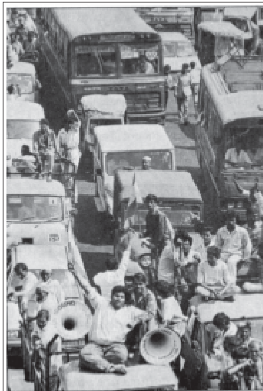
Campaigners block all traffic