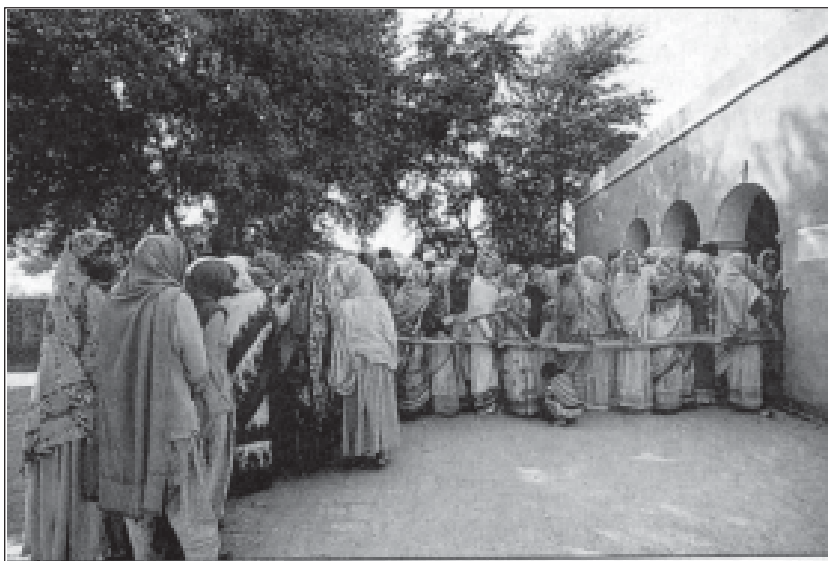
Women come out enthusiastically as voters; few participate as campaigners

“Perhaps only women like myself who had suffered from the cruelties, the injustices of men politicians, the man-controlled press, the man in the street, in England and Ireland while we waged our militant campaign for eight years there after all peaceful and constitutional means had been tried for fifty previous years, could fully appreciate the wisdom, nobility and the