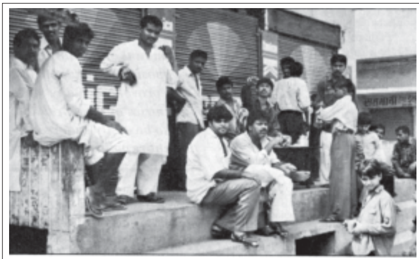
Men dominate the election day scene — Meerut elections, October 1996

atmosphere that prevailed in the 1920s. In response to the Indian agitation for representative government, the British government set up a committee headed by Montague and Chelmsford in 1919 to work out a proposal for constitutional reforms aiming at the inclusion of some Indians in government. Many groups presented their case for representation before the committee. Among the many delegations that met this committee, Sarojini Naidu and Margaret Cousins led a small delegation of women to demand that women be granted the same rights of representation in legislatures as men. The British government predictably thought this