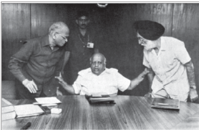
“You two stay by my side!” All three election commissioners after the meeting at the Election Commission office

This is not just due to the pressure on our politicians to be "politically correct" on women's issues. Indira Gandhi as the first woman Prime Minister of India was rarely attacked on account of her gender. If anything, she was able to use her gender to her advantage projecting herself as Mother India and Durga incarnate rolled into one. There was no fuss made over her assuming the highest political office in the land. By contrast, many of the supposed advanced