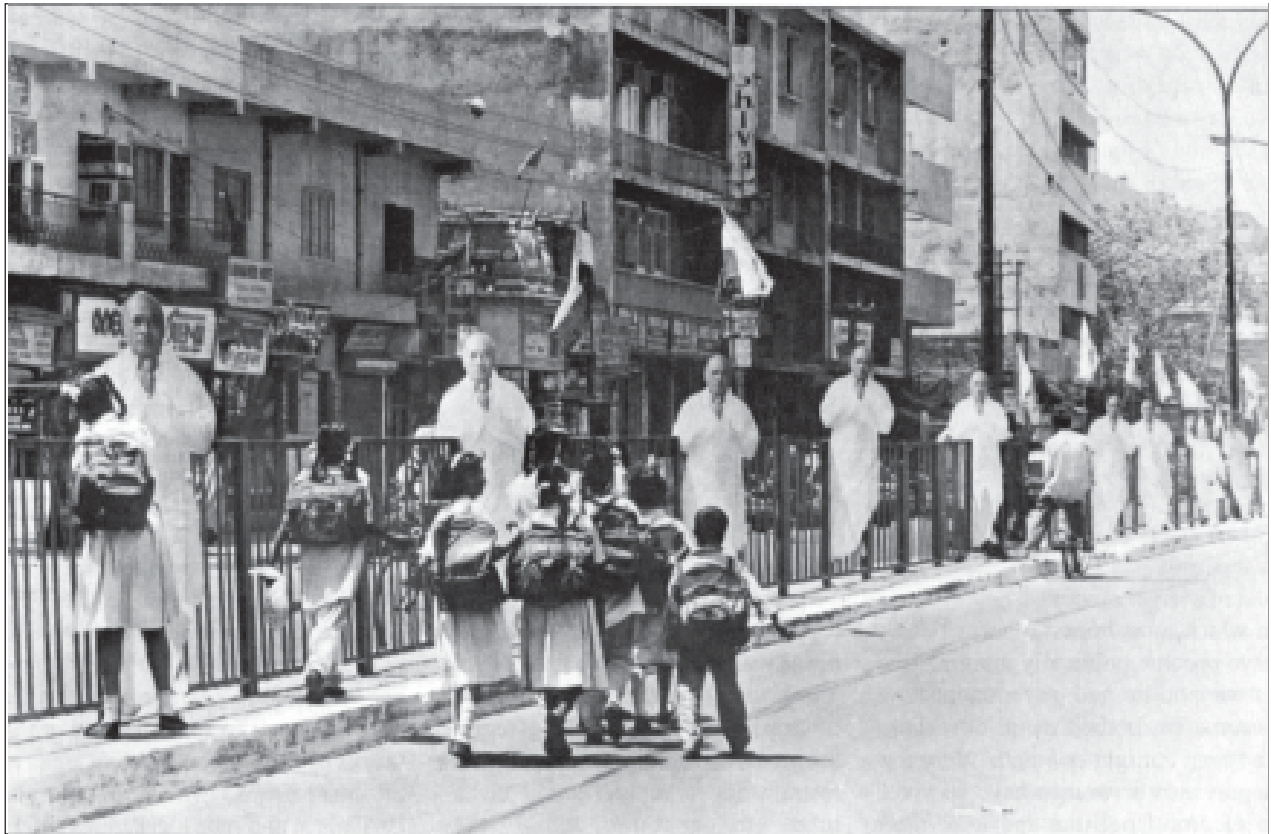
Cut-outs of P.V. Narasimha Rao put up on the road at Anand Parbat in New Delhi

women in our legislative bodies is that it seems to have no direct correlation with literacy and other seemingly logical indicators. A comparison between the states of Kerala and Rajasthan, whose literacy rates are at opposite ends of the spectrum, demonstrates this clearly. In Kerala, the overall literacy rate is reportedly 90 percent with 86 percent female literacy. By contrast, in Rajasthan, female literacy is a mere 20 percent and only 12 percent of the females are literate in rural areas. 3