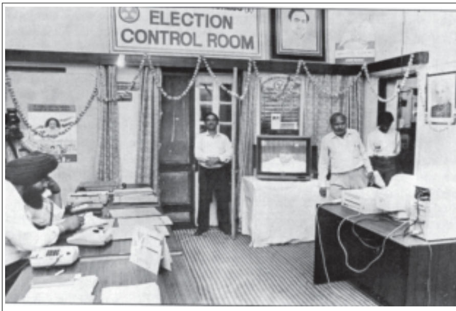
Election Control room with computers, fax, televisions and other communication instruments at the Youth Congress office

The workload of women and the nature of their domestic responsibilities makes it extremely hard for them to spare the kind of time required for making even a small difference in politics.