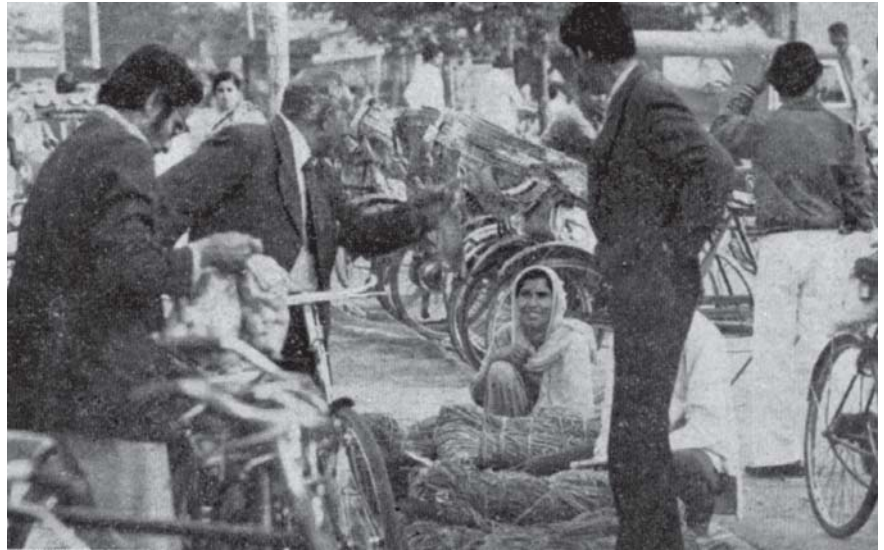
Selling rope at a consumers' forum sale, Chandigarh