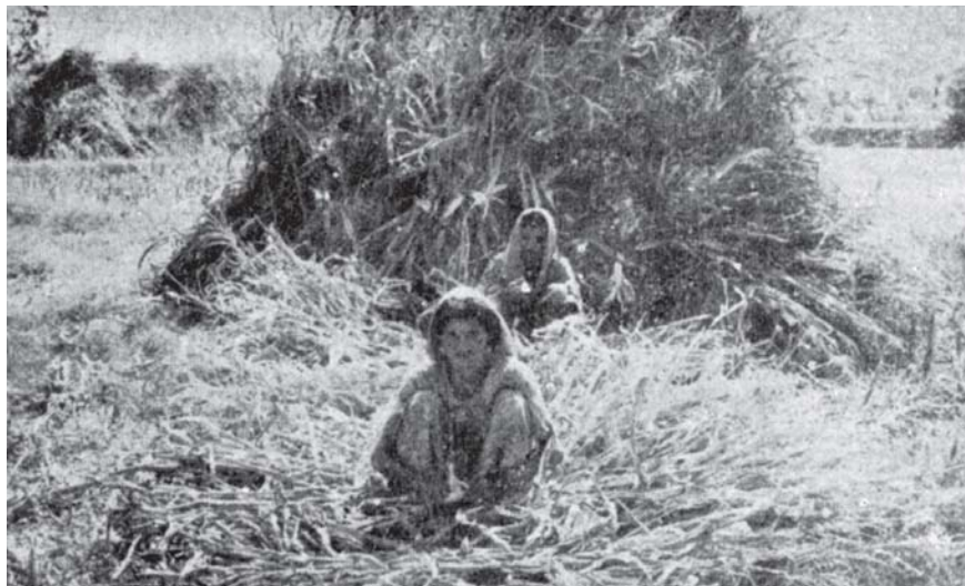
Women's work — harvesting and processing the maize crop

It seemed that, although less than in Sukhomajri, the attitude towards women going out to work was equally negative in harijan Nada. Despite conditions of acute hardship, the women had never considered going out to work on daily wages like the men. But they had