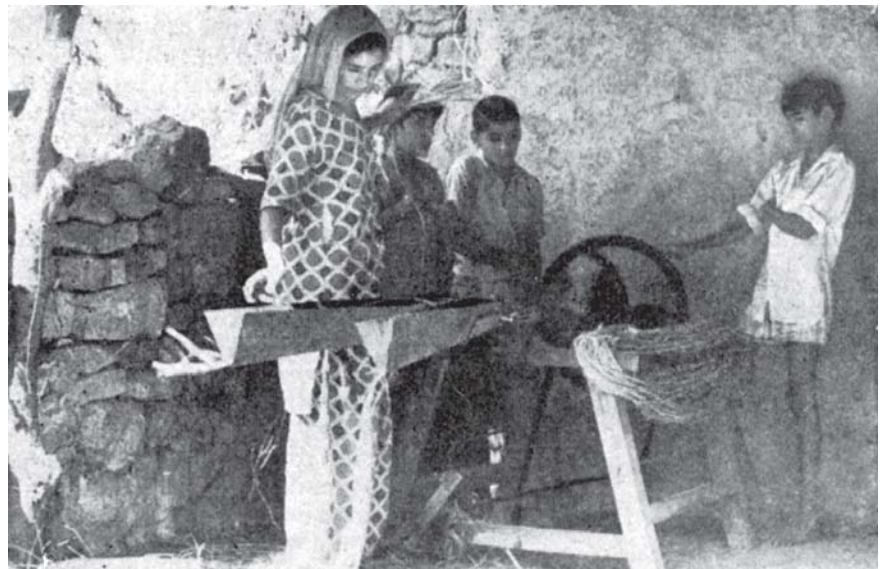
Working at her rope machine