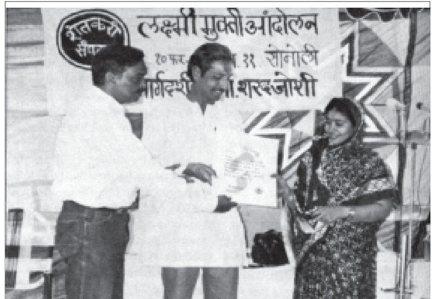
A couple being honoured with Lakshmi Mukti certificate, village Sonoli

back in the palace, but Sita insisted that wherever Ram goes, there goes Sita. She said, my place is by your side. She suffered numerous privations for him joyfully. Finally Ravan abducts Sita for no fault of hers but to teach Ram a lesson for his misbehaviour with his sister. Though Ravan respected her chastity and did not violate Sita, her own husband subjected her to the cruel humiliation of agnipariksha to prove her chastity. Even fire could not touch her but on their return to his kingdom, at the mere hint of a