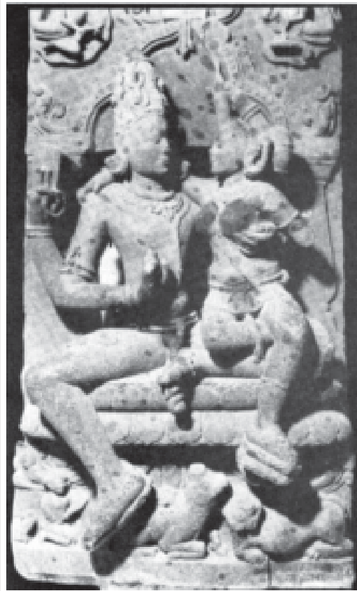
Uma-Mahesvara, Khiching Museum

While there has been a lot of discussion and analysis of the demands put on women in the Hindu tradition, the sacrifices expected of ideal wives, we have failed to evaluate the demands put on an ideal husband. The Hindu tradition might valourise wives who put up with tyrannical husbands gracefully but it does not valourise unreasonable husbands. On the contrary, it places heavy demands on them and